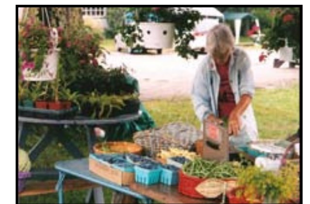
Millie at Farmers' Market

The students did a lot of hands on work helping to construct a clay and brick outside oven where they bake delicious loaves of bread. We were shown a partially finished solar kitchen where soda cans painted black and built into the front wall helped to raise the temperature inside substantially. These young people are enthusiastic and proud of their efforts, and learning a lot about food sustainability through practical experiences. This gives hope for the future and we applaud them!