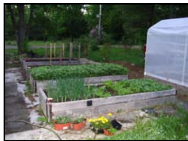
Square Foot garden bed.

It's a lot of work and expense to build a bed, but once built you'll get years of great harvests for very little work compared to a regular garden system.