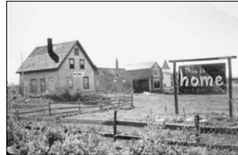
H.O.M.E. in 1970