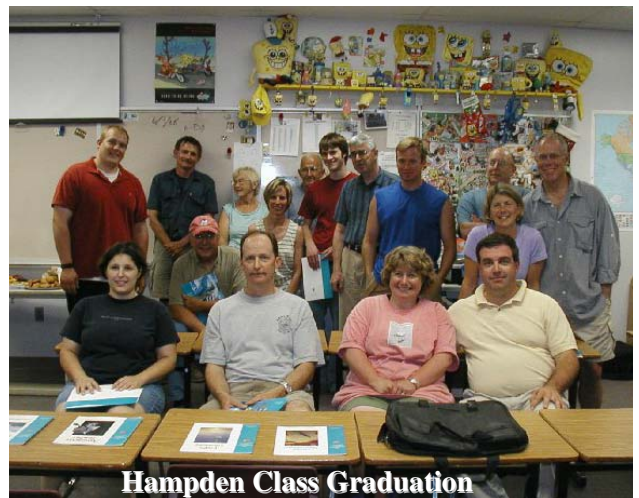
Hampden Class Graduation