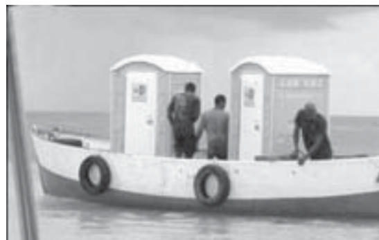
New style "service" boat